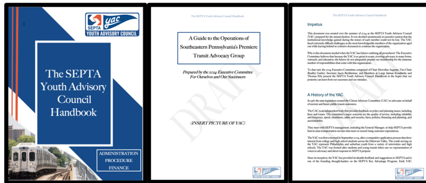
SEPTA YAC Handbook

The YAC has begun drafting an official handbook. The 2024 Strategy and Implementation document focused on a significant challenge to the organization which was the loss of institutional knowledge from members aging out. The executive committee took it upon itself to rectify this problem for future generations. This handbook works in tandem with the bylaws to explicitly outline all of our administrative duties, policies, and financial matters. Much research is necessary to complete the Handbook. As mentioned previously, many capabilities the organization once had have been lost. The Executive Committee is working tirelessly to ensure that anyone can run the organization for years to come.